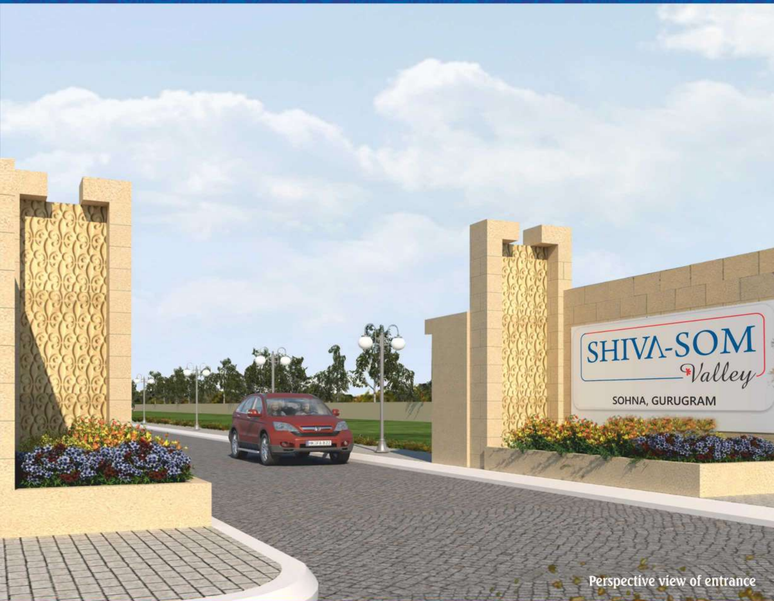
Perspective view of entrance