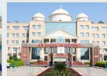
K.R. Mangalam University