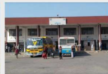
Near Sohna Bus Stand