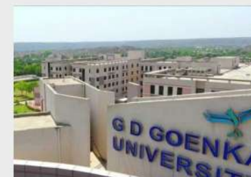
G D Goenka University