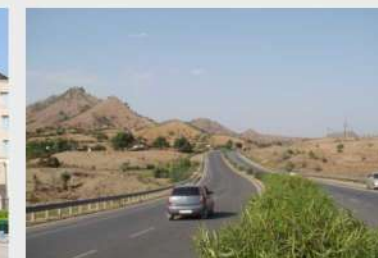
Close to Aravalli Hills